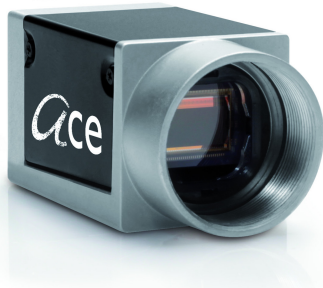
High speed camera from Basler AG

Introduction: In the department of flow calculation, the company from Baar called Rittmeyer is one of the leading providers. The water flow rate is measured by means of ultrasonic signals, which are sent through the water from transmitter to receiver. The parameter for calculating the speed is based on how long these signals travel. This method works very well for clear water. Although in the case of dim water, the signal is attenuated and the measurement can fail.