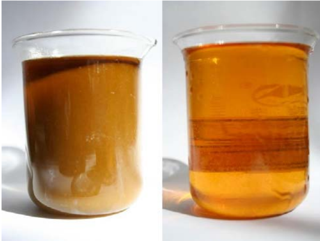
Before and after pretreatment