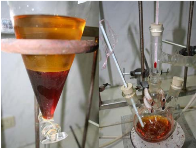
Separation and distillation of biodiesel