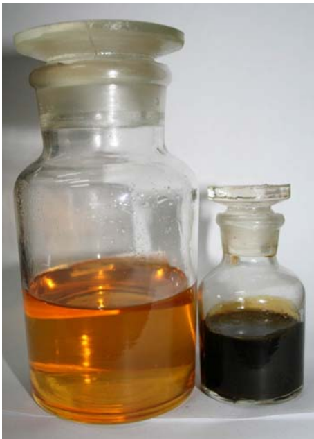
Produced biodiesel from WCO

Problem: The restaurants of Shanghai produce 90 tons of waste every day and at present \frac{1}{3} of it is processed into animal food. The main by-product is the waste cooking oil which can be transformed into biodiesel with the appropriate treatment. This product could be sold instead of being disposed.